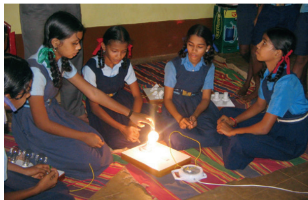
Girls learning electrical wiring techniques.

While LAHI had to proactively approach schools to sell the program when it was first launched, in recent years this pattern has reversed. Local communities' increasing appetite for the program and high attendance rates at existing partner schools have encouraged new schools to seek out the IBT course.