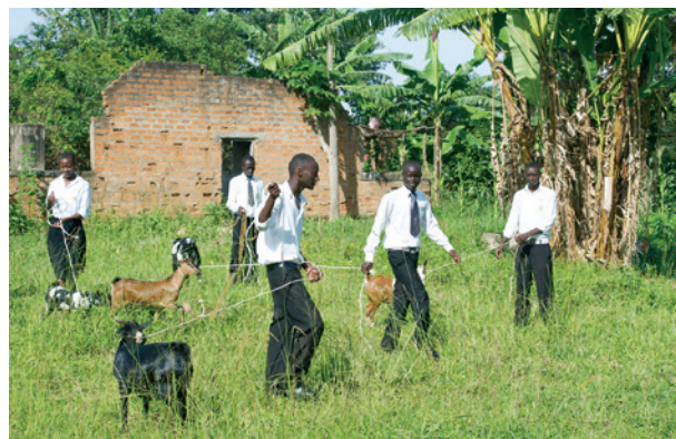
Educate! Scholars working on their goat farming project that they created as part of the Educate! Club.

In the program, mentors start working with students ("Educate Scholars") in their second to last year of secondary school, with the program continuing for two years. Students are selected based on their commitment and motivation, with about 30 students at each school selected for mentorship. This application process means that students are more likely to be fully engaged in the program. Meanwhile, mentors are strong recent graduates from local universities in Uganda, and receive thorough training before being placed at partner schools. Each mentor at the partner school works directly with students to help build essential non-cognitive skills such as self-confidence, communication, and leadership.